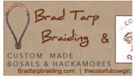
<u>Bradtarpbraiding.com</u> | thecolorfulcowgirl.com